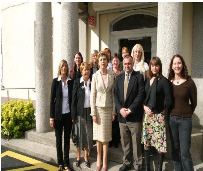
The President of Ireland, Mary McAleese with all the Staff of TRP